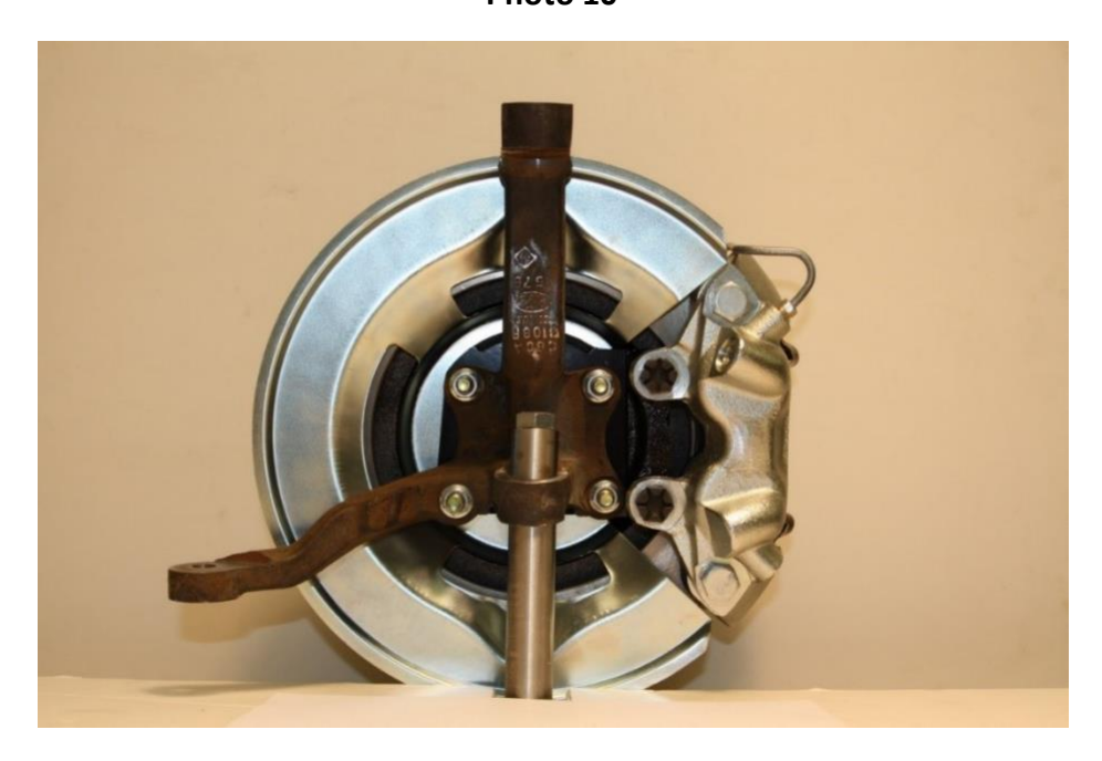
Front of car→